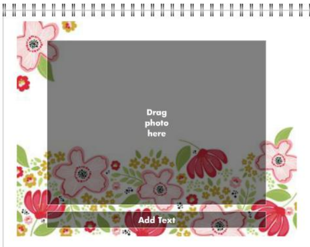
Sample Cover Template