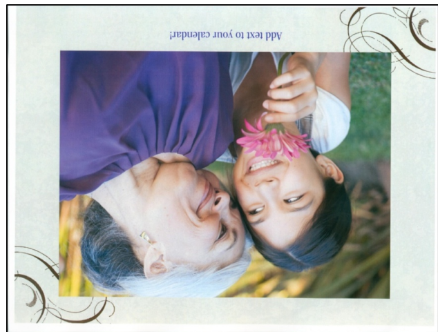
Sample Even Numbered Page